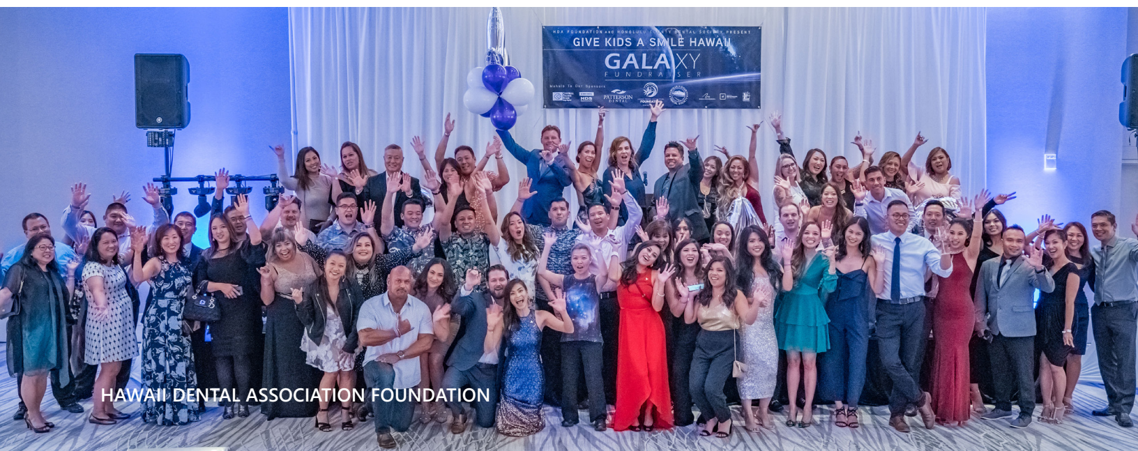
HAWAII DENTAL ASSOCIATION FOUNDATION

Please check with your accountant or financial planner about how to donate your assets toward the future of Hawaii's oral health. We'd be happy to discuss and tailor gifting arrangements with you!